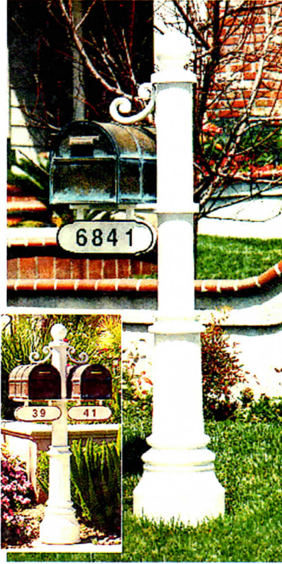
SI-103 Westchester Mailbox SI-223S Newport Mailbox Pole

IMPERIAL MAILBOX SYSTEMS 3901 Norris Lane Millbrook AL 36054 Phone: 800-647-0777 Fax: 334-285-6635 info@imperialmailboxsystems.com www.imperialmailboxsystems.com